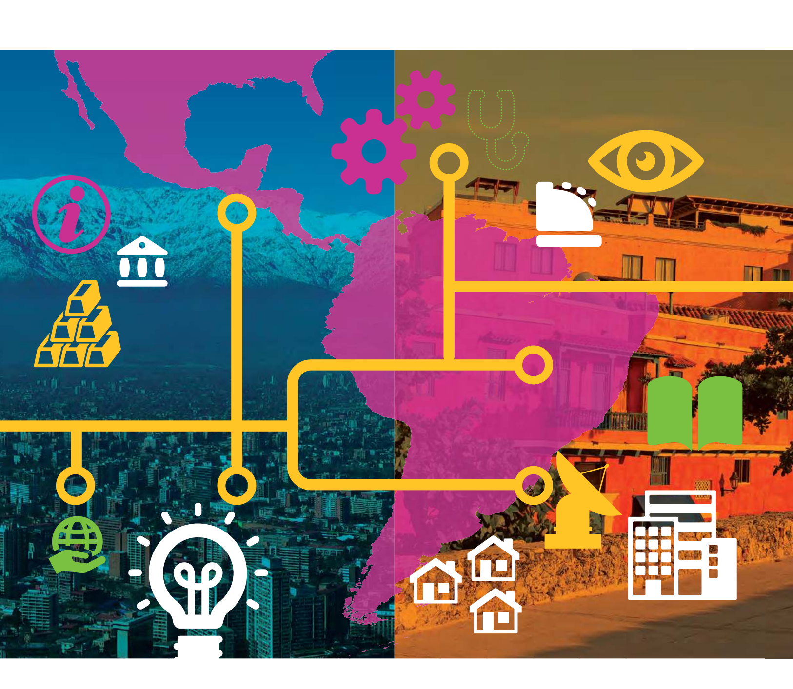
PKF in Latin America